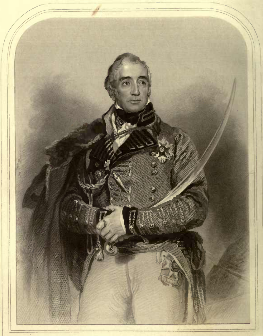
Sir Thos d Lawrence.